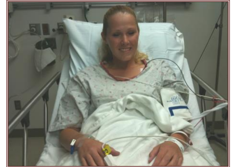
1 of many hospital admissions in the past months

One of YWAM's core values is family first and then ministry. Our family has every intention to be in missions for a long time. In order to ensure longevity, we need to keep our priorities, God, family and then ministry.