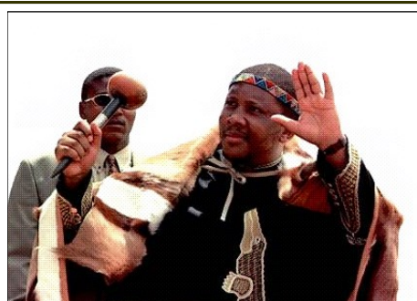
King Letsie III