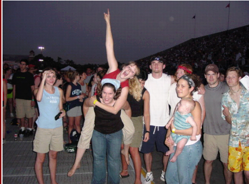
One last time working with the youth of Newlife

This is still something we are getting used to as we have committed to this life as missionaries. It has been told to me that we should not say "good byes" but "see you later's". I see the truth in that statement since those of the family of God ultimately will hold an invitation to the greatest eternal party.