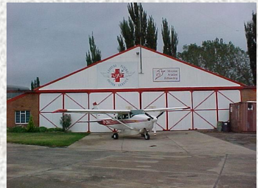
This Is Our North Pole