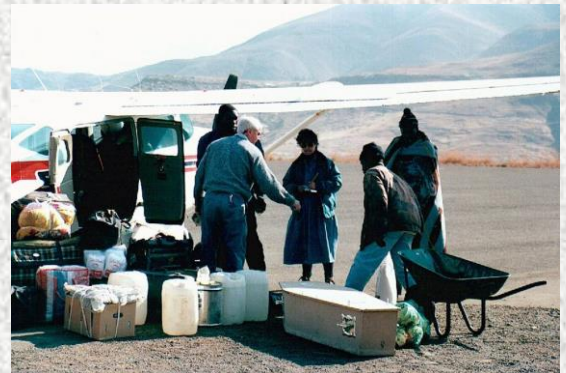
Delivering Presents From Our Sleigh