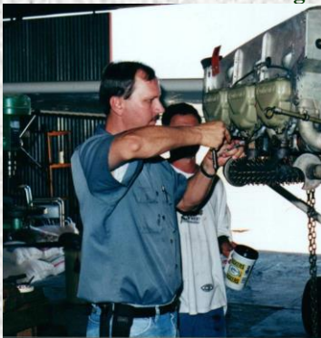
This Our Chief Elf