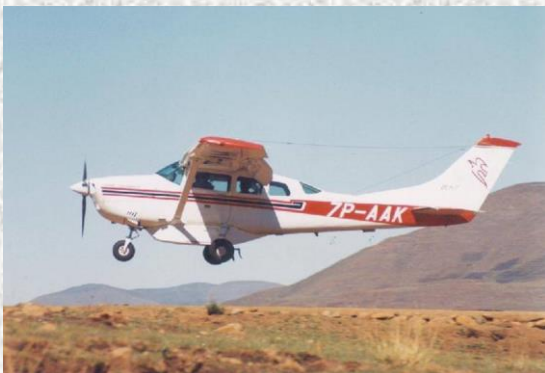
This is Our 300+ Horse Sleigh

Now as we are a part of this ministry we realize how MAF is a lifeline to so many all over the world. In Lesotho alone, MAF is the only viable avenue for medical clinics to the mountain tribes of the Basotho. Wow, what a responsibility. That is why I say some day soon I will get to be Santa to these people flying in my 206 sleigh.