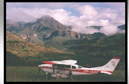
Lesotho Mountain Airstrip