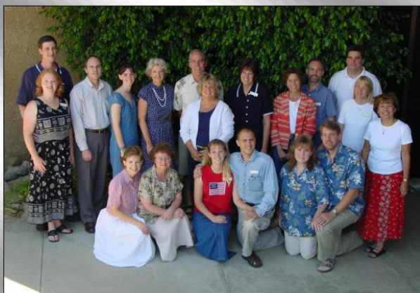
Our Candidate Class, Summer 2003

Our classes are now over, and we were taught well. Our classes included cross-cultural training as well as MAF history, policy, and procedures. The deputation training is something for which we are very thankful. The purpose of the training was to prepare us for going out to raise our ministry support through several means such as speaking at churches, meeting pastors, sharing at "coffees", etc. I guess you will see how well we learned when we come and visit in your area!