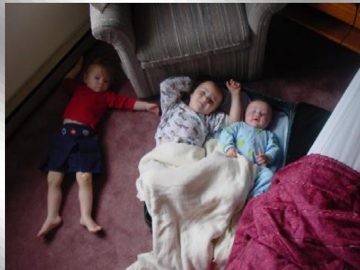
Not your Typical "Preflight"