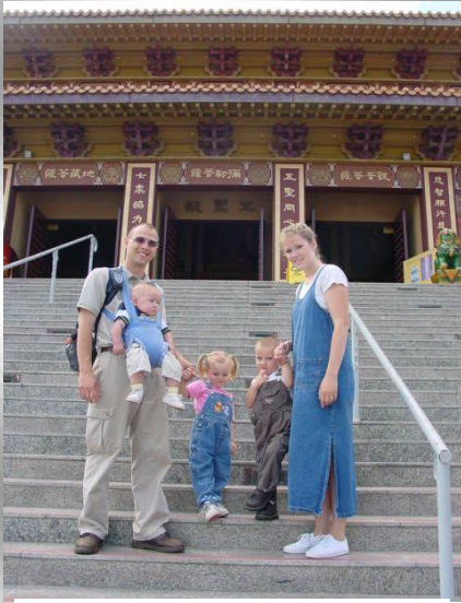
A Little "R and R" for Us