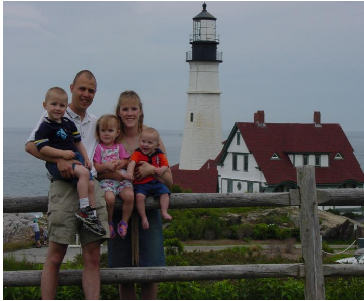
The Siebrings in New England